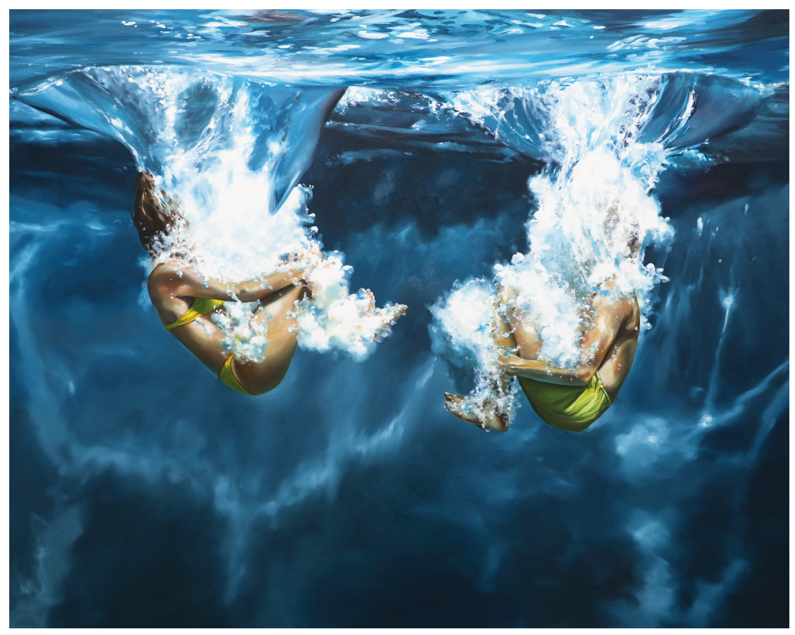
Everything In Its Right Place, Oil on Canvas, 48" x 60"