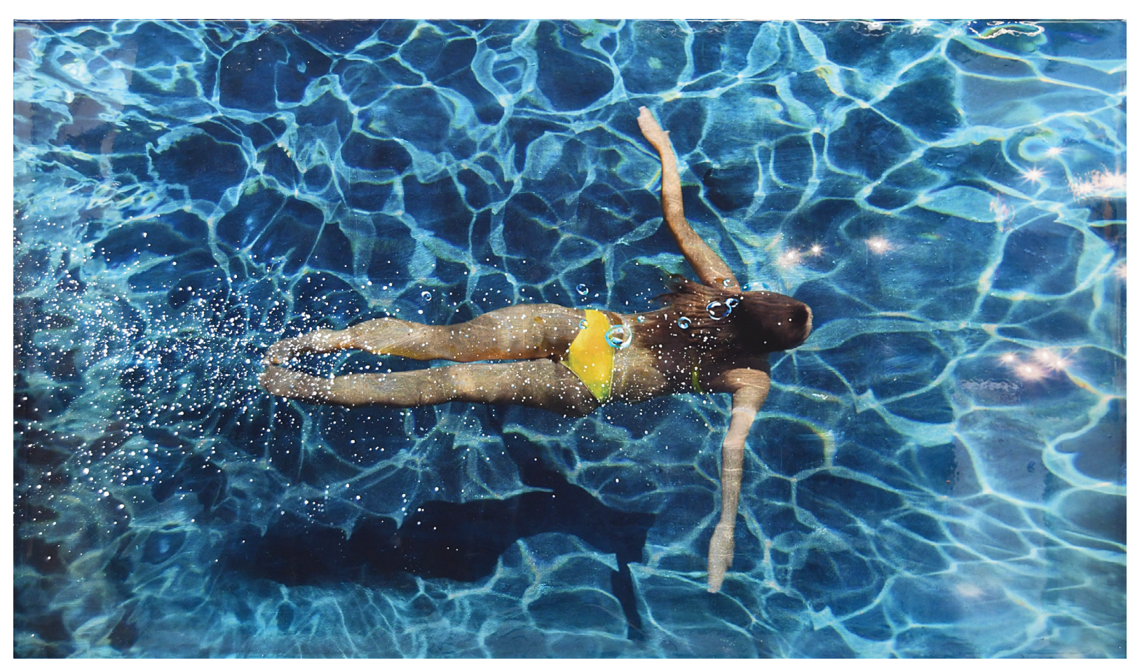
Lemon Sun, Mixed Media with Resin, 41" x 72"