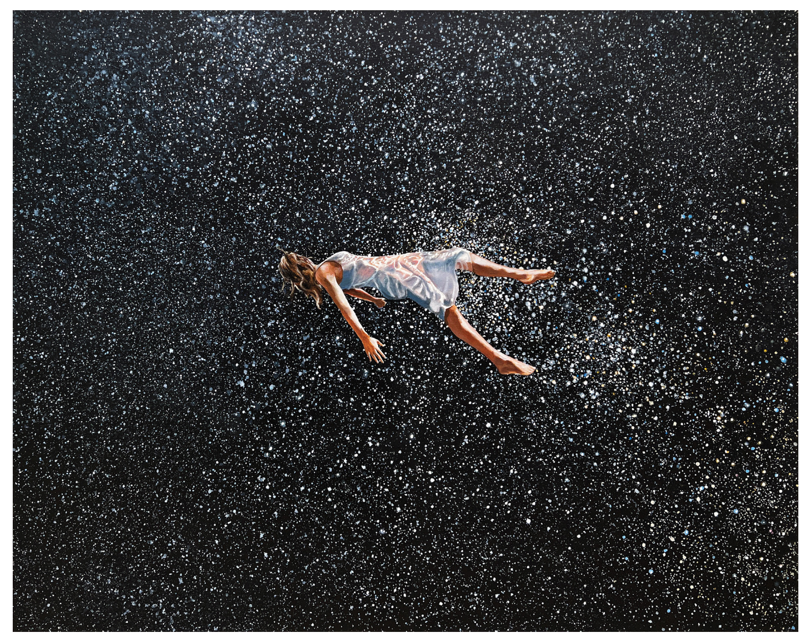
Floating By, Oil on Canvas, 38" x 48"