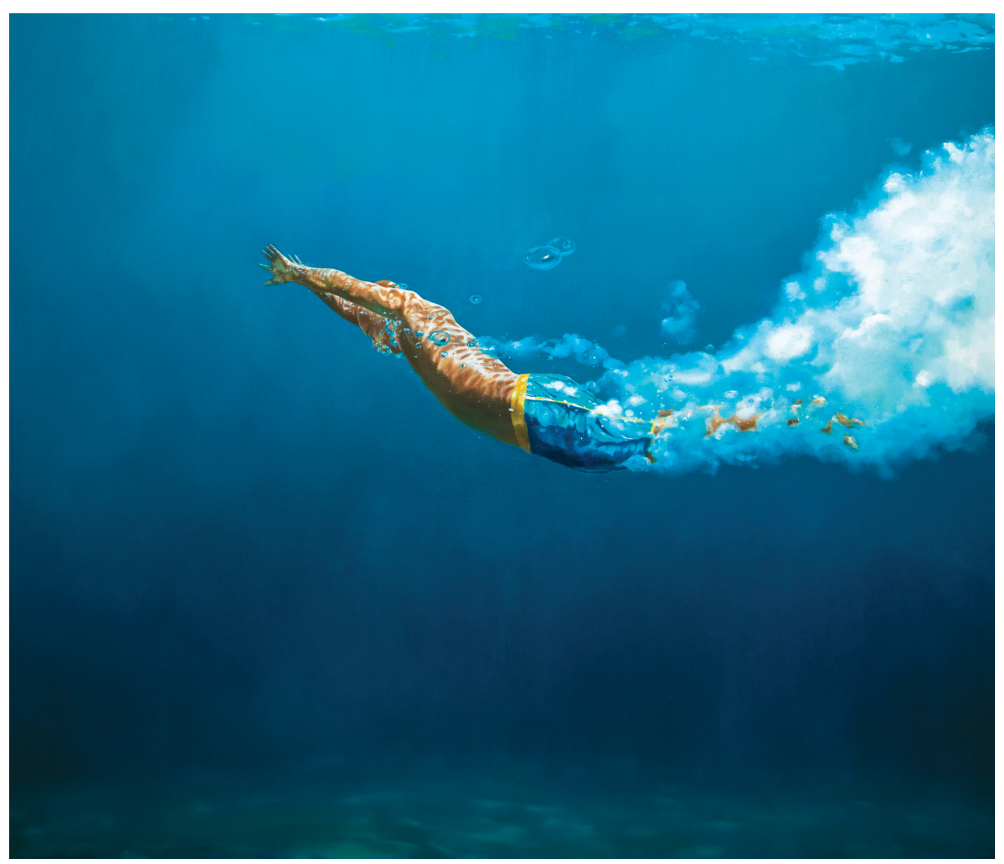
Self, Oil on Canvas, 72" x 84"