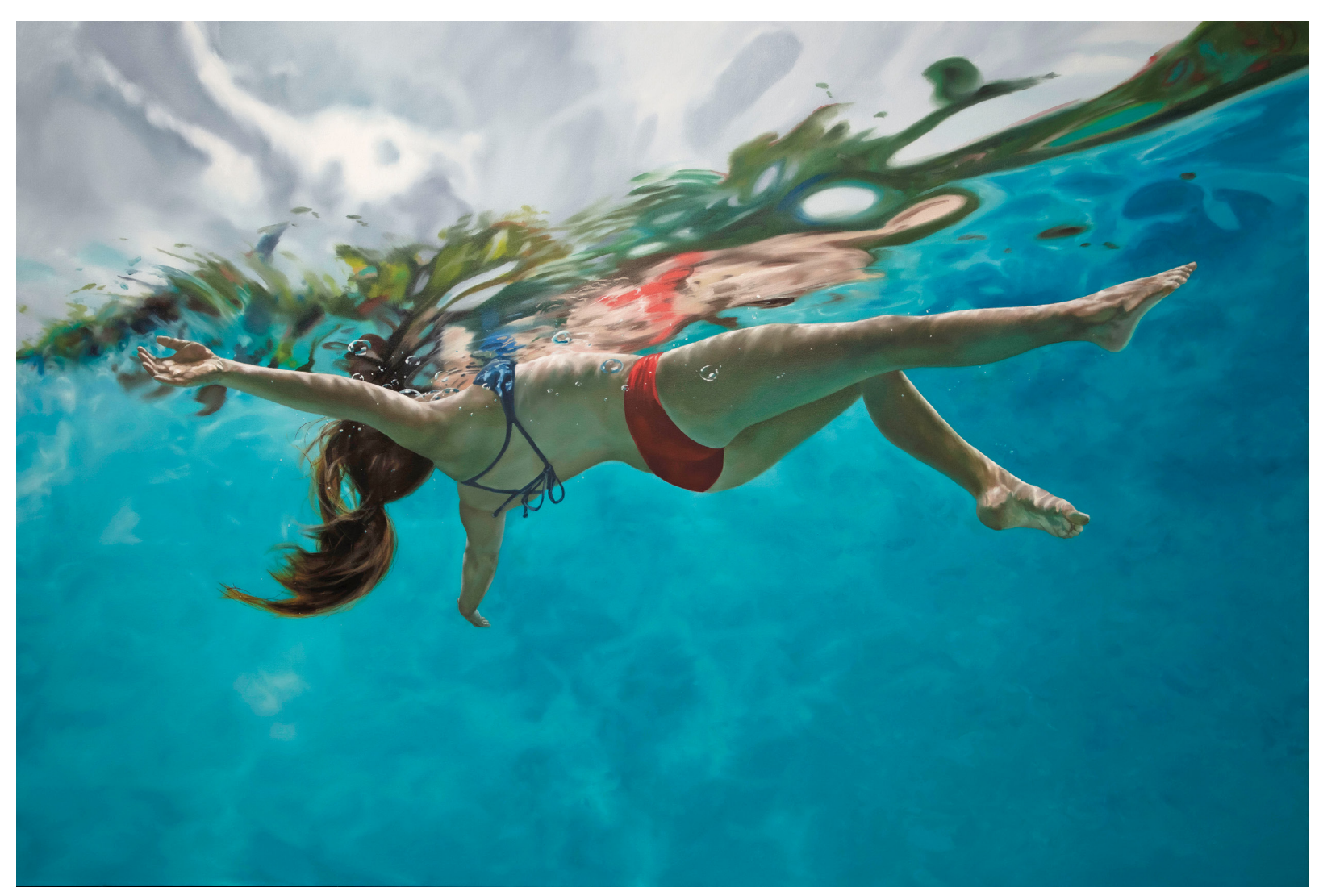
Ethereal, Oil on Canvas, 60" x 90"