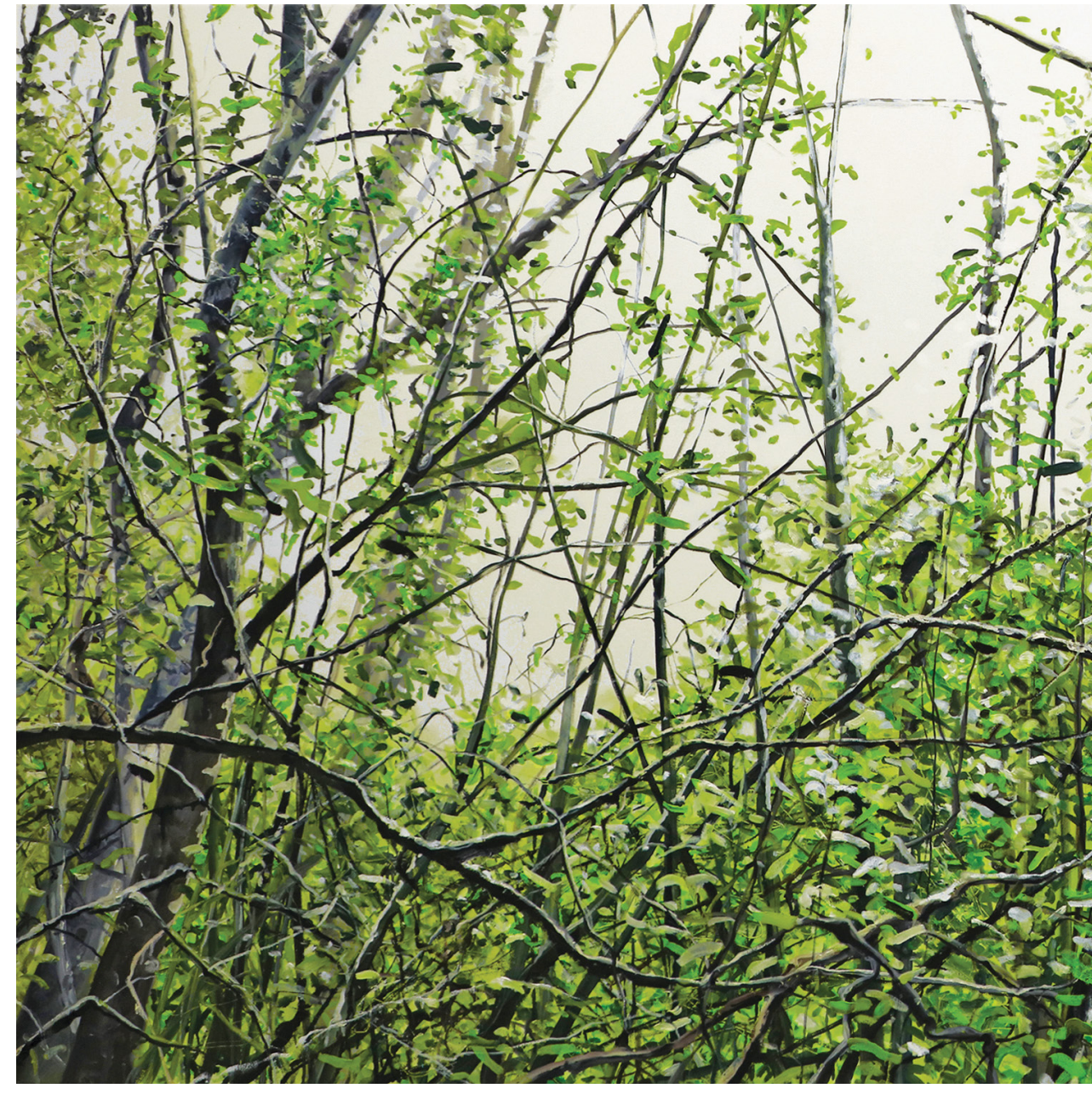
Long Journey, Oil on Canvas, 54" x 108"