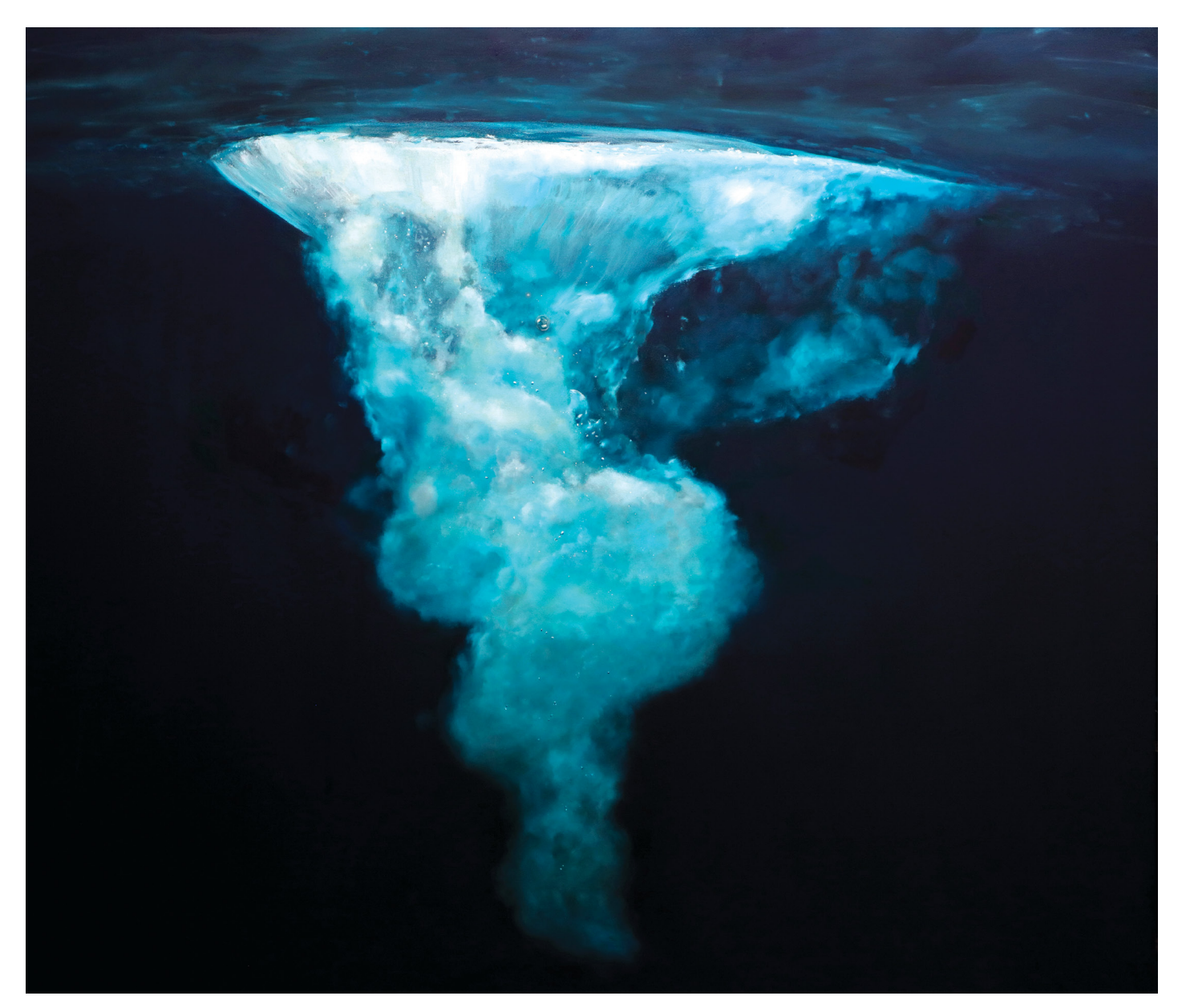
Night Plunge I, Oil on Canvas, 72" x 84"