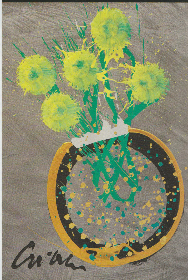
Ikebana Blossom , 2019